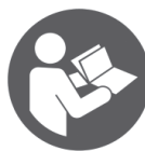
Refer to instruction manual

IMPORTANT: PLEASE READ THESE INSTRUCTIONS CAREFULLY. NOTE THE SAFE OPERATIONAL REQUIREMENTS, WARNINGS & CAUTIONS. USE THE PRODUCT CORRECTLY AND WITH CARE FOR THE PURPOSE FOR WHICH IT IS INTENDED. FAILURE TO DO SO MAY CAUSE DAMAGE AND/OR PERSONAL INJURY AND WILL INVALIDATE THE WARRANTY. KEEP THESE INSTRUCTIONS SAFE FOR FUTURE USE.