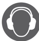
Wear ear protection