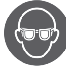
Wear eye protection