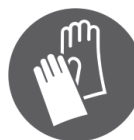
Wear protective gloves